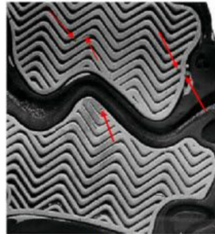
Figure 2(B) Known Shoe